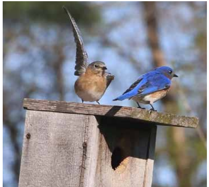
Female wing-waving at the Lakeshore Nature Preserve.