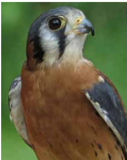
Adult male: Pat Ready

snakes. They are forced to compete for a limited number of nesting cavities, sometimes fighting off and evicting bluebirds, squirrels, and other cavity nesters.